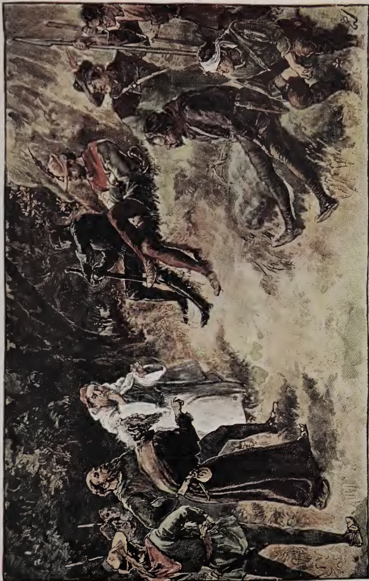
"AH!" SAID ROBIN, "THE CHURCH IS ALWAYS WILLING TO AID IN CHARITY."